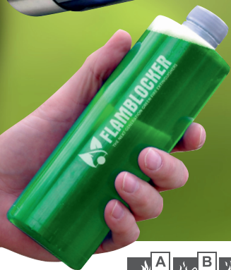
Flamblocker® Throwing Grenade